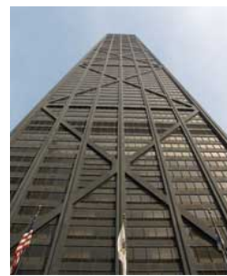
The John Hancock Building

The next TBWG meeting has been scheduled for April 28 & 29, 2009 in Chicago, Illinois. The photo to the left shows the Water Tower Place Mall and